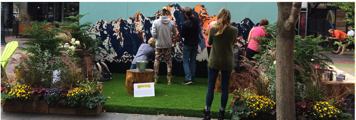
Visitors stop by Oliver Russell's Park(ing) Day exhibit and help bring an Idaho landscape to life using paint by numbers.

We continued our pop-up parks for Park(ing) Day on an even bigger scale by including great partners. Ada County Highway District Commuteride, American Heart Association, Oliver Russell, and Stack Rock Group joined us to show that roads belong to all of us so let's take back the space and enjoy a Friday afternoon of sunshine and great people.