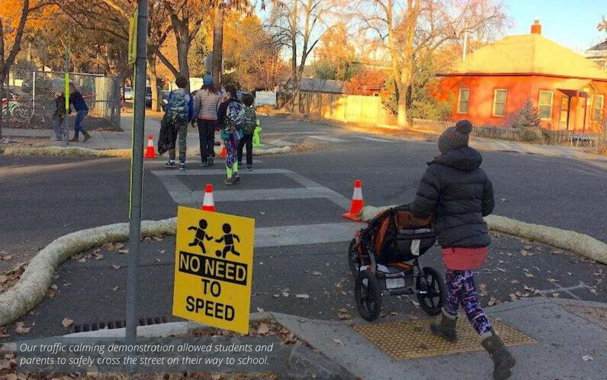
Our traffic calming demonstration allowed students and parents to safely cross the street on their way to school.