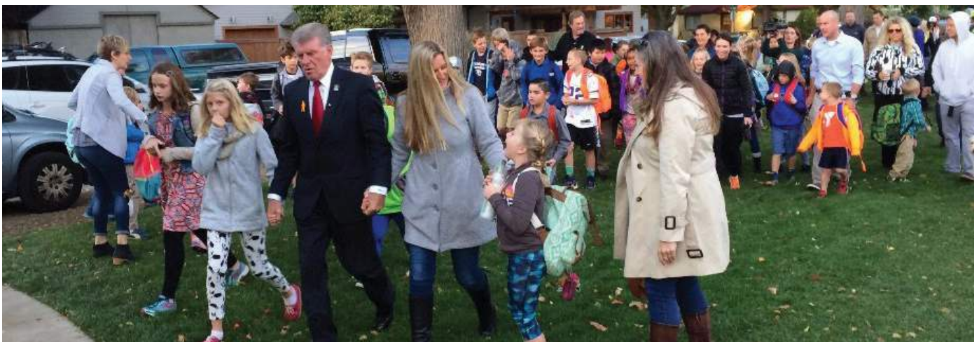
Bottom: Governor C.L. "Butch" Otter, U.S. Congressman Mike Simpson, students, staff and parents at Longfellow. Top: Captain Crosswalk at Garfield.