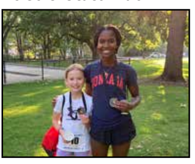
We hosted a Run For Safe Streets live in Boise and virtually throughout the state.