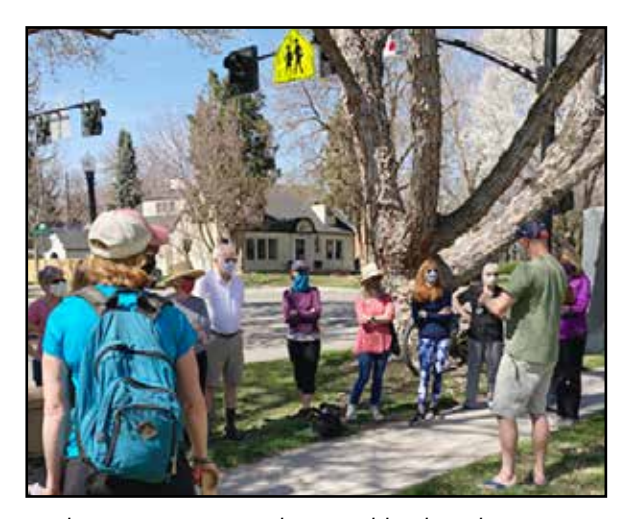
Radar gun training with a neighborhood on a spring day; ready to help this neighborhood improve safety on their streets.

This solitary time forced us to sit quietly and look within. It allowed us the space to strengthen our core, tighten our processes, and grow the capacity of our small team. We built a more solid foundation that is prepared for those great moments of success which only come from many hours of ongoing, hard work behind the scenes in a non-profit.