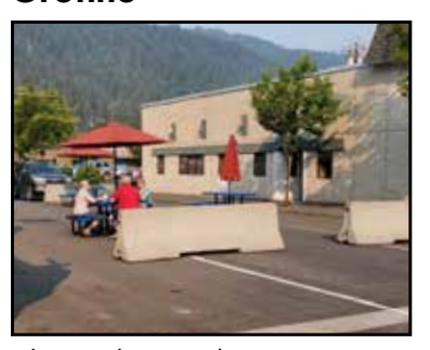
Placemaking in downtown Orofino