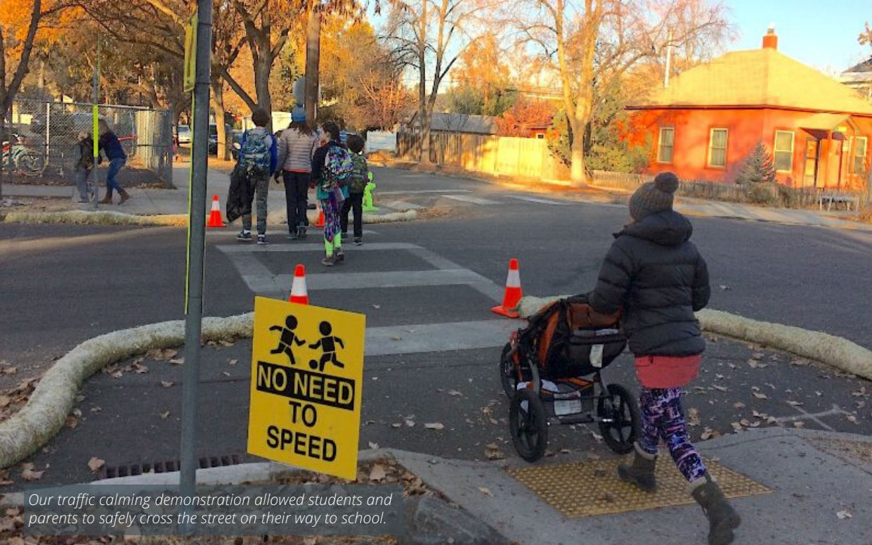
Our traffic calming demonstration allowed students and parents to safely cross the street on their way to school.